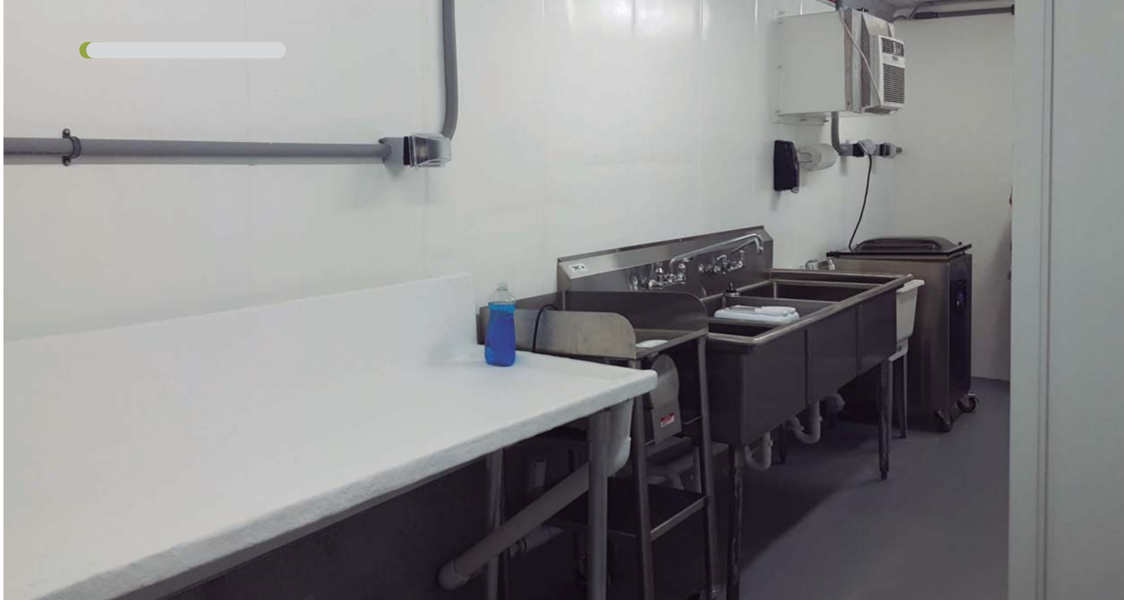
Image 2. Condition and cleanness of food contact surfaces.

every corner and fissure. Scrubbing brushes should be kept clean and sanitized, and used for cleaning food contact surfaces only.