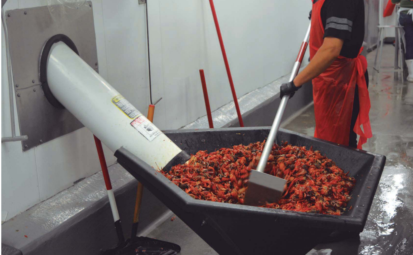
Image 1. Color coding for food waste handling.

Contamination of wells can occur due to floods or heavy rains, location close to septic tanks, or cracks or improperly sealed equipment. Seawater must meet the same requirements for municipal and private sources, and so must be treated and tested.