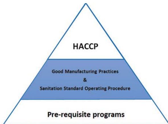
Figure 1. Food Safety Pyramid. Good Manufacturing Practices, Sanitation Control Procedures, and other pre-requisite programs are necessary to build a strong HACCP program.

The FDA regulates all seafood products except for fish from the Order Siluriformes. FDA requires seafood processing facilities to monitor conditions and practices during