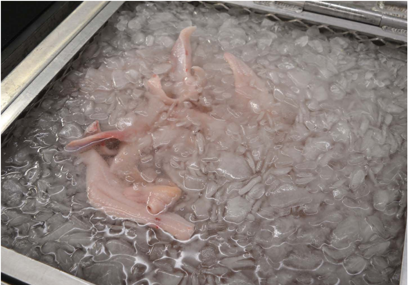
Image 3. Safety of Ice.

An adulterant is a substance that will contaminate the food product: non-food grade lubricants, fuel, pesticides, detergents, and sanitizers.